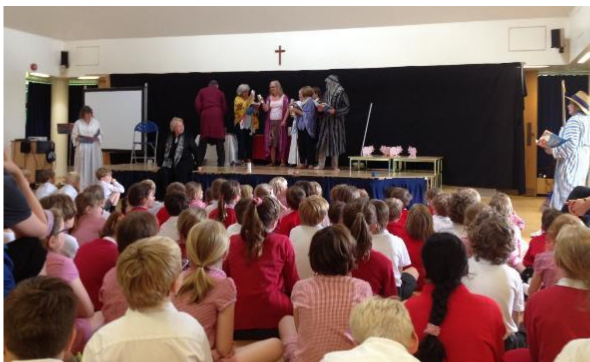
'Open the Book' at Whitewater School, summer 2016