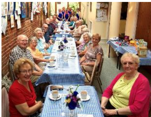
Delicious!-The Lunch Club in Hook

A whole host of people support our churches, congregations and parishioners through Morning and Evening Prayer, Bible Study and Fellowship Groups, All Age Worship, Open the Book, Messy Church, Fingerprints Toddler Group, Adult and Youth Emmaus courses, Marriage Preparation courses, the Coffee Shop and Lunch Club, Pastoral Care Groups, Craft Groups and our Magazine and its outreach.