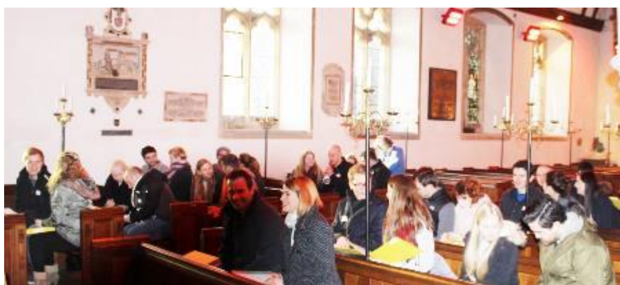
Marriage Preparation Course 2016 at St Michael's Heckfield