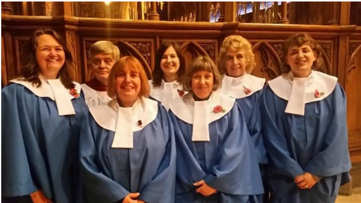
Some members of St John's Church Choir at the Winchester Choir Festival, November 2016