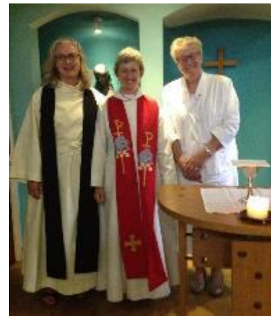
The Lady Chapel, Hook

There are now five Bible Study Groups across the Benefice and numbers are growing within them, alongside a range of programmes that support and develop faith within the Benefice for both adults and youth including children's activity groups. In January 2017 we shall see five teenagers and nine adults complete Emmaus Courses and be confirmed.